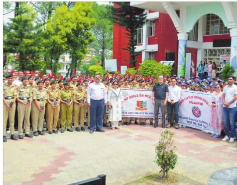
Tributes being paid to the martyrs of the Kargil War at Shaheed Capt Vikram Batra Govt College, Palampur.

The state lost hundreds of soldiers in the Kargil War and militancy operations. If one looks at the figures, Kangra, Hamirpur and Mandi districts have received the highest number of bodies. In the past 20 years, most of the attacks were reported from Jammu